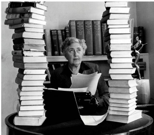
Dame Agatha Christie (1890-1976) poses with her oeuvre. Throughout her life, Christie wrote seventy-four novels, most of which were mysteries, and one hundred and sixty-four short stories.